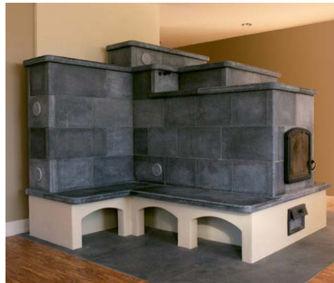
ALLIANCE OF MASONRY HEATER AND OVEN PROFESSIONALS, INC.

The Alliance of Masonry Heater and Oven Professionals (AMHOP) is an association of businesses committed to furthering the masonry heater and oven industry within the hearth industry. We engage in the technical, educational, legislative, regulatory, and promotional realms. Our goal is to provide the communities we serve with the highest quality products possible by encouraging and providing for the professional development of our member businesses and those who serve in them.